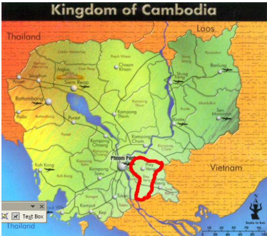
Figure1: Map of Cambodia

The indication shows that more than 50% of woman beggars among the thirty people we have interviewed come from Prey Veng province, and most come from two specific districts: Mesang and Kampong Trabek.